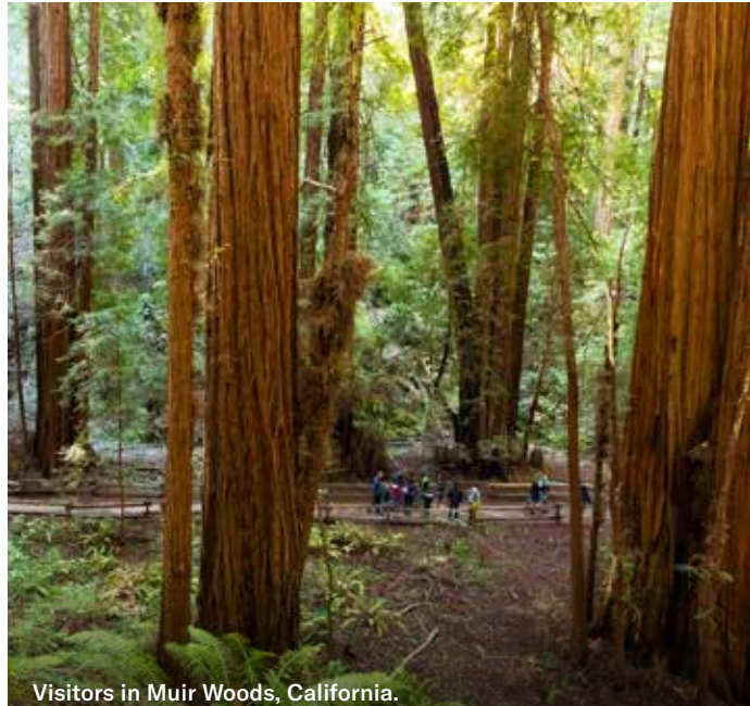
Visitors in Muir Woods, California.