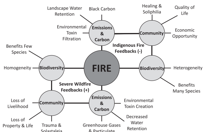
Fig. 2. Conceptual feedback model of Indigenous fire compared to severe wildfire.

Ecocultural stewardship clearly provides many possible benefits to ecosystem health and resilience. In a time of decreased connections to nature among the broader public—at least until it is gone—ecocultural stewardship provides many benefits to individual and community health. Solastalgia has become common vernacular in Indigenous communities and communities impacted by natural disasters. Having agency to proactively address vulnerabilities and create resilience within country through stewardship is a way to reduce solastalgia and concomitant impacts of intergenerational trauma (see refs. 67, 117, and 118). Soliphilia (22, 65) is an antonym of solastalgia wherein the love of country is established through place-based relationships and developing social responsibility for a shared future in symbiosis with the environment. The phrase “healthy country supports healthy communities” epitomizes the holistic health benefits of stewardship. Stewardship involves physical, mental, and spiritual engagement. The stewardship activities of Indigenous peoples in Arnhem Land, Northern Territory, Australia, demonstrate some benefits of IS on